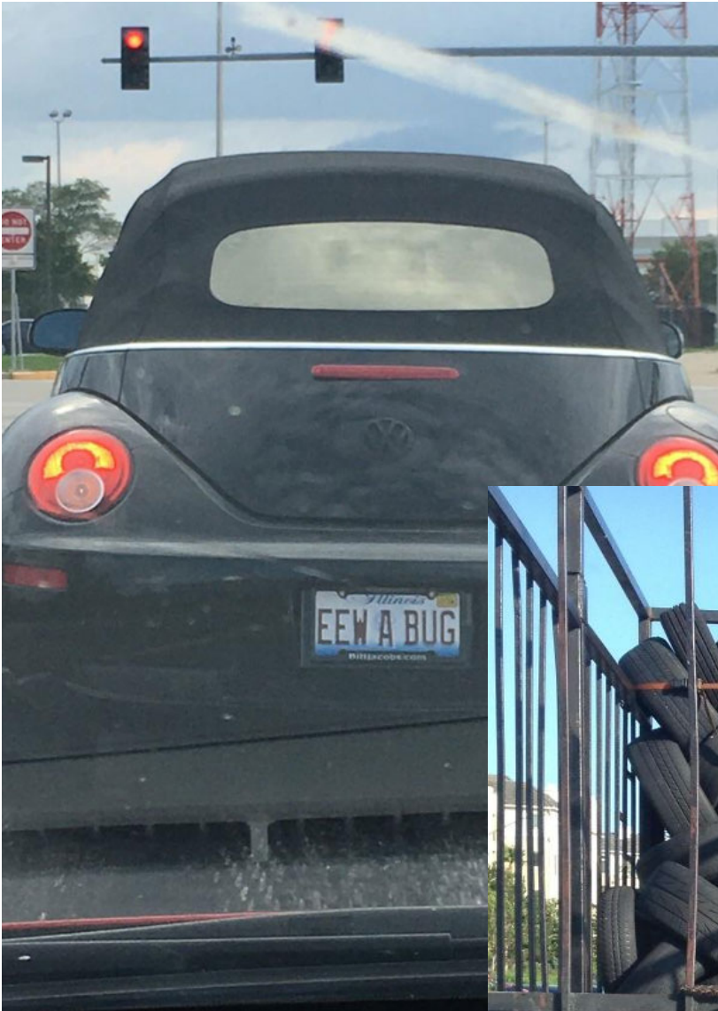
Clever license plates