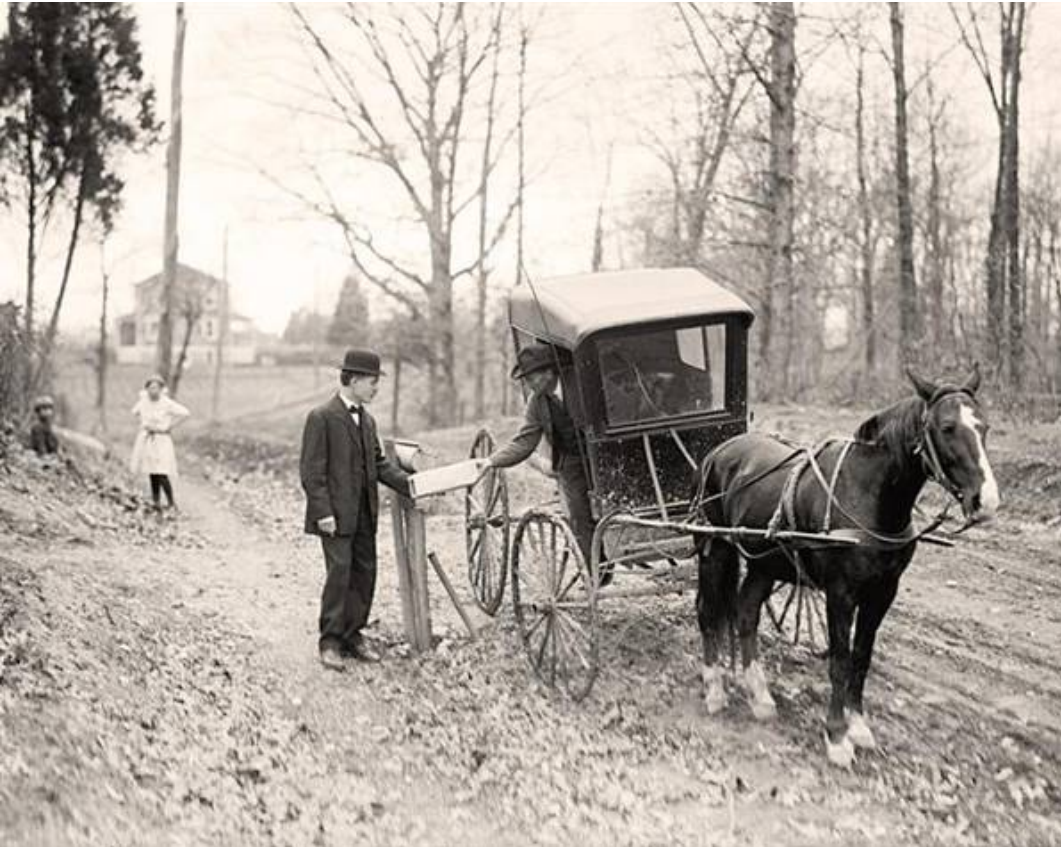
Rural mail delivery - circa 1914