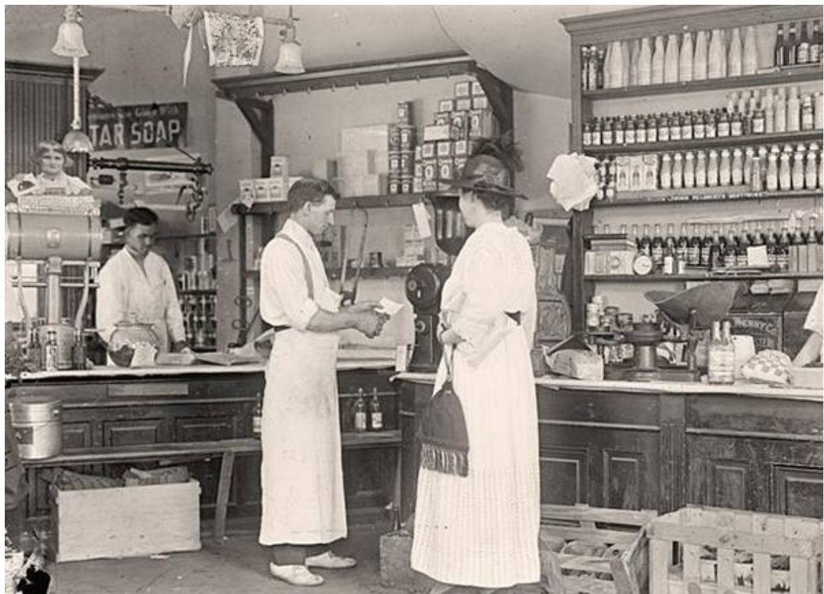
Old General store – circa 1917