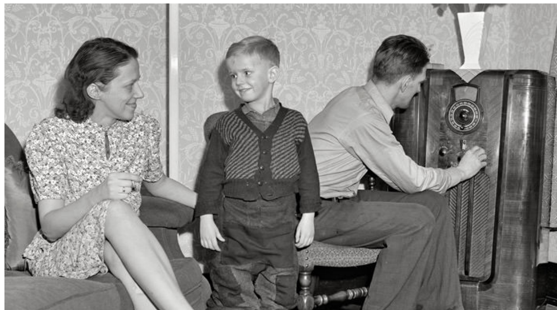
An evening at home - date unknown.