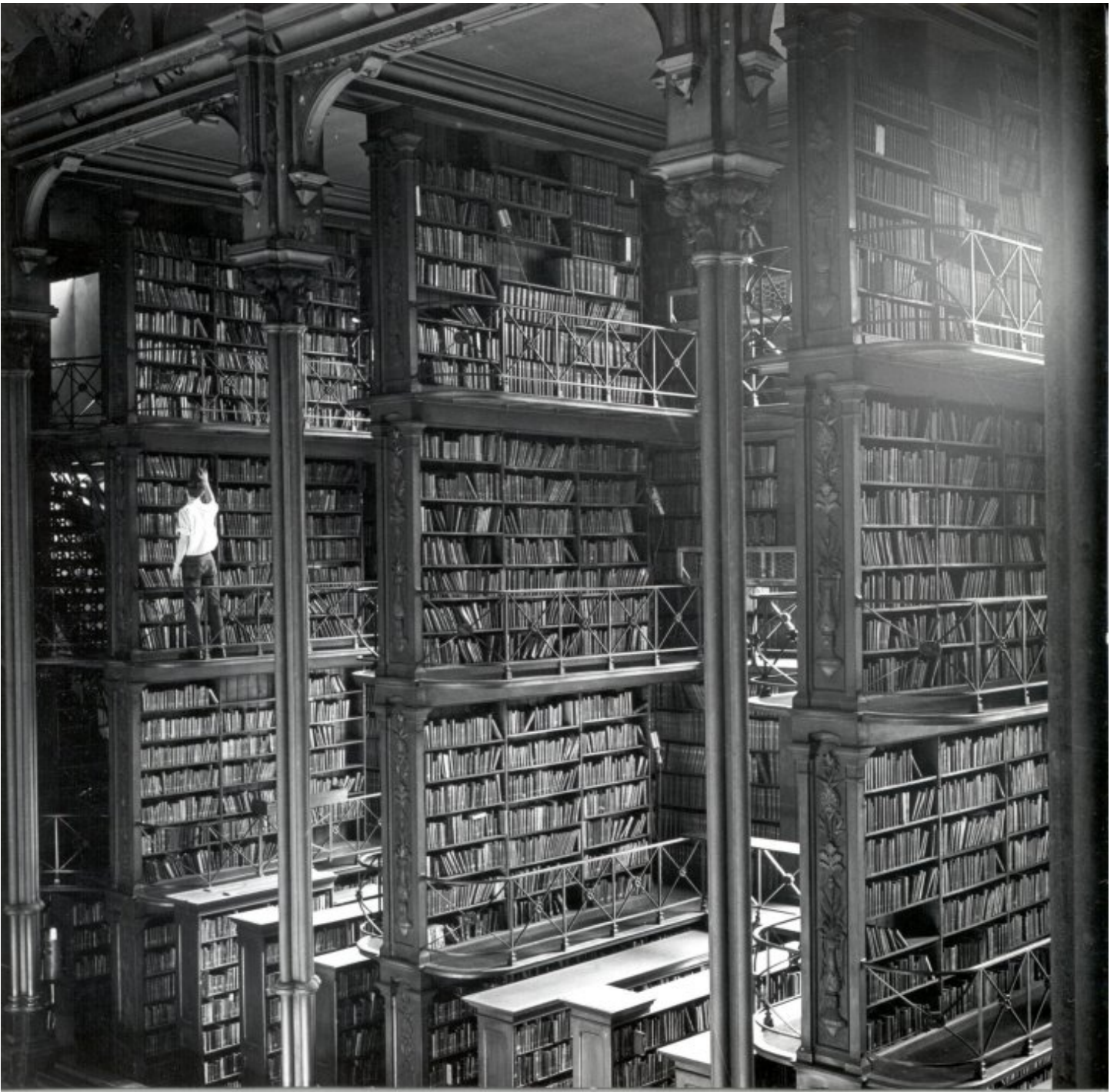
Cincinnati's cavernous main library demolished in 1955.