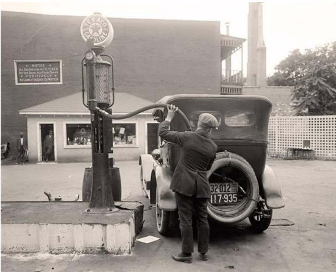
Pumping gasoline – circa 1925