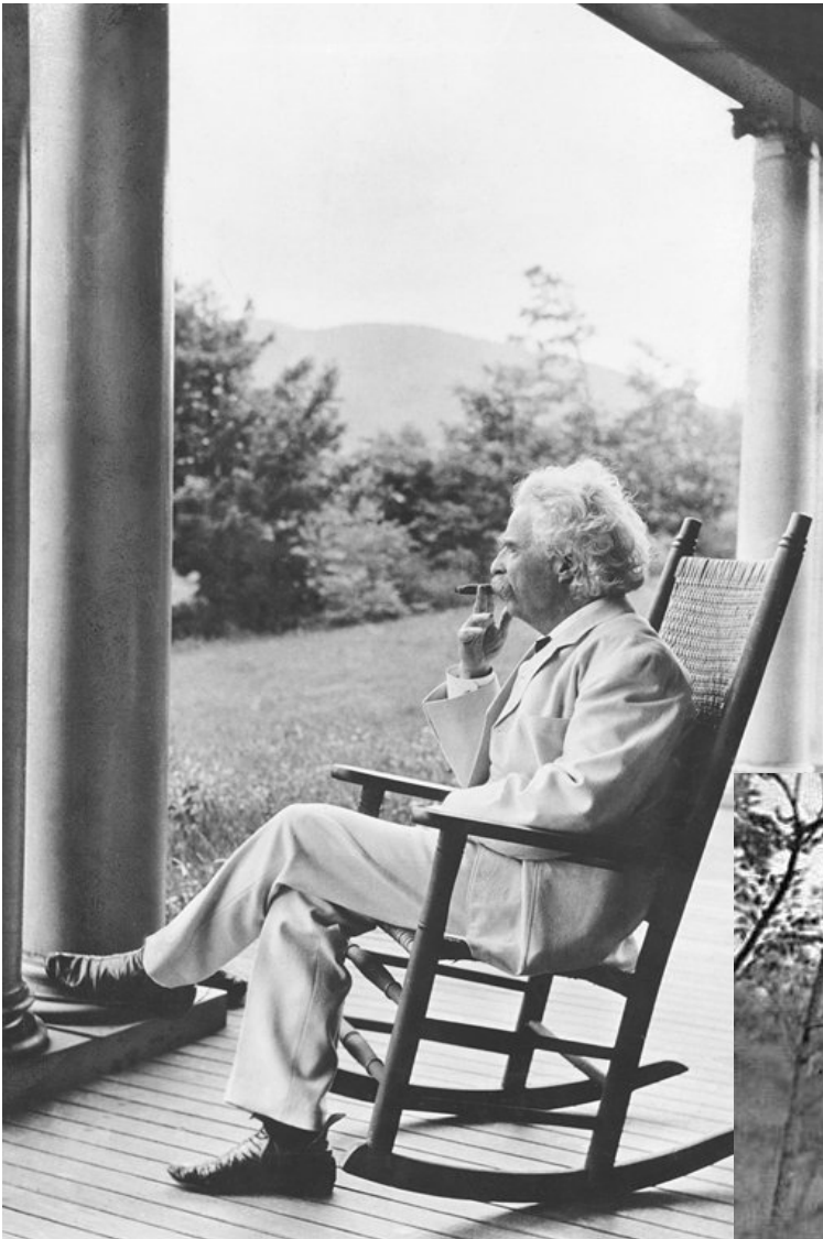
Mark Twain smokes a cigar in 1906